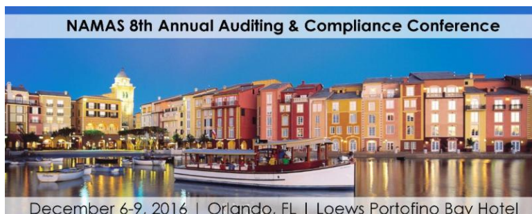
NAMAS 8th Annual Auditing & Compliance Conference

There's Still Time to Register for the NAMAS 8th Annual Auditing & Compliance Conference in Orlando, FL !